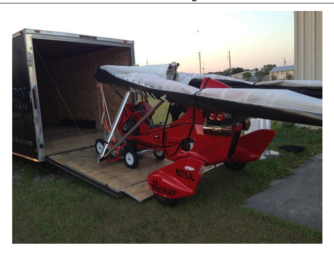
REVO dolly cart shown

•ATTACHING SAIL TIES Fasten the first tie just aft of the rear cable. By keeping the keel tube outside of the tie, it will make it easier to organize the control bar in this area after the wing is flipped over. The forward tie is located splitting the distance between the control frame apex and nose plate. Pull the leading edge pocket up over the top of the wing so the top of the LE Mylar pocket is touching and/or overlapped. The third sail tie goes about 2 feet inboard from the leading edge tips.