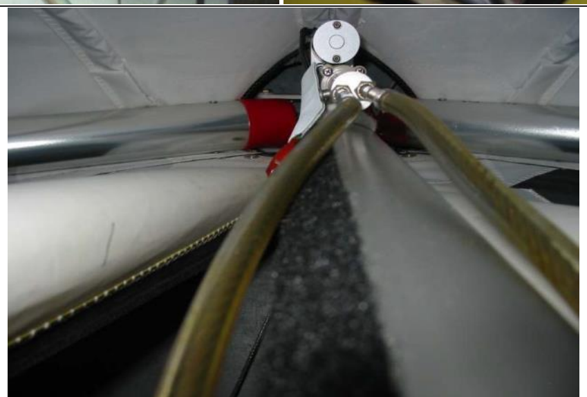
binding and you cannot locate the problem, be patient and ask for support from the dealer or factory.

WARNING: The electric trim linear actuator MUST be removed when folding the wing. This is done by taking the pin out of the actuator's main body, removing the machined round cylindrical barrel that has two cables screwed into it and unplugging the electric. There are no short cuts around this step without causing damage.